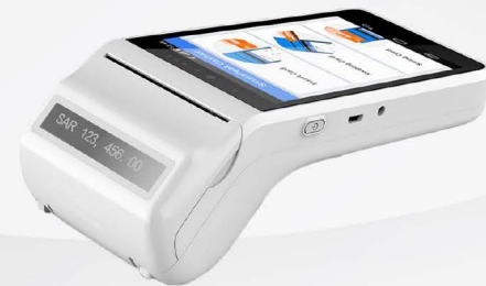
Optional Secondary Display