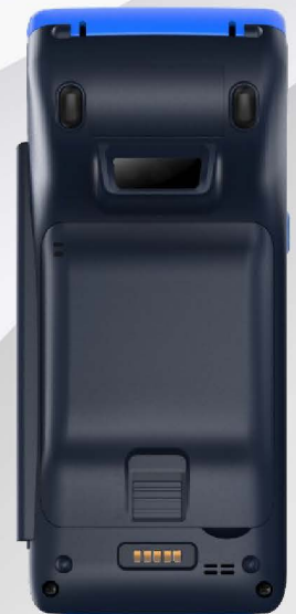
Optional Large Battery